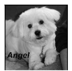
The 3 dogs shown above were among those adopted during 1st quarter.