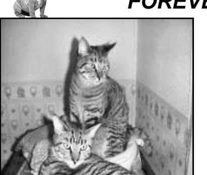
BUTTERCUP and DANDYLION She and he are twins and would love to stay together.