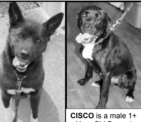
Year Old Boxer / Labrador mix.