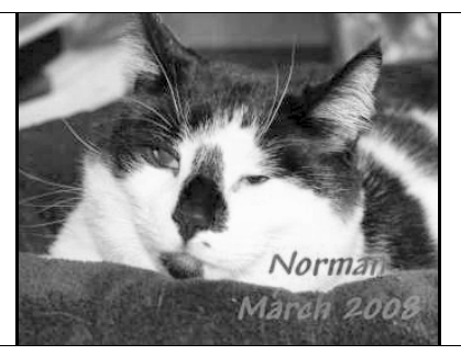
1 1/2 Year Old Domestic Short Hair Cat NORMAN