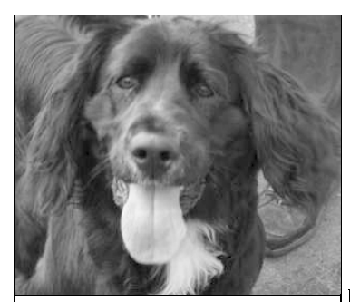
ROXY is a Young Female Spaniel