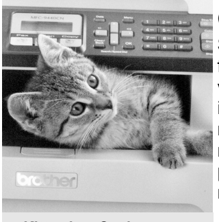
Kitten in a Copier— Nicknamed "CopyCat"