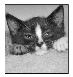
These 3 animals were among those adopted during 2nd quarter.