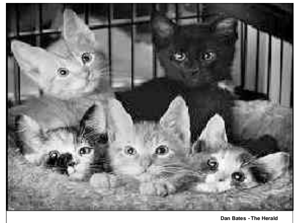
Bottom Row: Tux, Talker, and Trina; Top Row: Tucker and Timmy.

As a one-year anniversary of the generous outpouring, we thought you would like an update on the financial status of the shelter