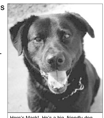
Here's Mack! He's a big, friendly dog.

chain was bolted to his collar. He must have been tied up in a backyard with that old cable and chain for a long period of time. One day he got his chance to escape, and Mack, as he was named at CASA, ran free dragging that chain still attached to his collar into a section of woods on the island and became tangled up around a tree. He ended up with the chain wound so tightly around that tree that there was no chance for him ever getting himself free. When Animal Control was contacted, the caller stated that the dog had been barking for days. There was no doubt he would have died if someone had not eventually reported the annoying barking dog. The shelter staff came to love Mack very quickly. He was a super dog who loved everyone at the shelter including all the other dogs. Someone came to CASA looking for a dog and immediately fell in love with Mack and decided to adopt him. So Mack now has his Forever Home and he'll never have to run away again!