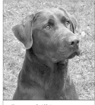
Ranger Griffith, adopted April, 2010.

Visit <u>www.camanoanimalshelter.org</u> or <u>www.petfinder.com</u> to view and read about all of our adoptable animals.