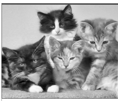
KITTEN SEASON IS BACK!!!