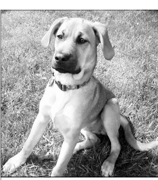
Buddy Allen, formerly named Deboe at CASA. Adopted April, 2010. Training to be a service dog.