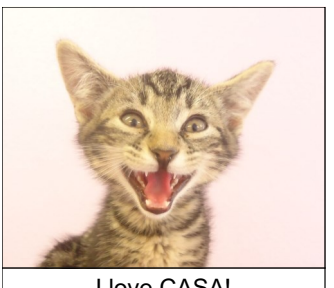
I love CASA!