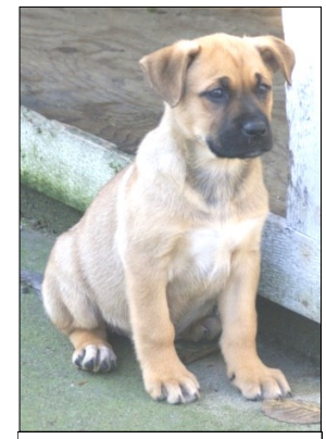
Ready for a new life. Look at those paws!