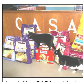
Inquisitive CASA residents check out the donation.

Wed - Fri 11 - 311 - 4Sat 11 - 3 Mon & Tues Closed