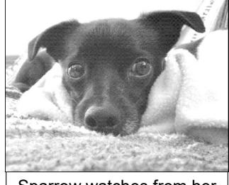
Sparrow watches from her warm blanket.