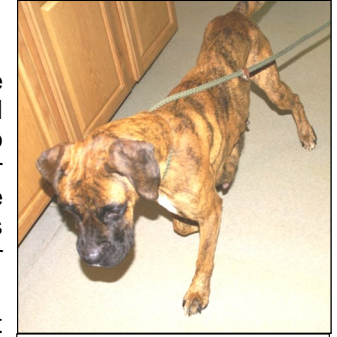
NaeNae arriving at CASA, just skin and bones

The rescuer was worried about NaeNae and her puppies and out of desperation, called the only vet in the area in hopes that they knew of the person who owned her. Amazingly, NaeNae and her puppies were all at the vet's. NaeNae had been kicked in the face