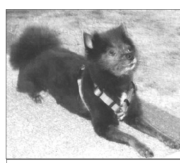
Blue Copley Adopted November, 2012