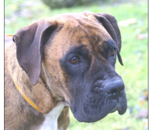
NaeNae as she left for her foster home

they needed and NaeNae was literally skin and bones. With nine nursing puppies and her now requiring a soft food diet, her weight would remain a struggle.