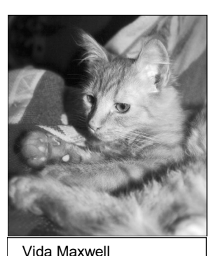
(formerly Cheerio) Adopted November, 2012