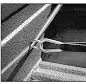
A cross-tether dog harness will keep your dog safe.

Don't own a truck? Remember to use a dog tether seatbelt in your car to restrain your pet. Unrestrained pets are a major distraction to drivers, and can cause vehicle collisions. In a crash, pets become flying objects and can cause serious injuries to themselves and others within the vehicle. * From Whatcom Humane Society