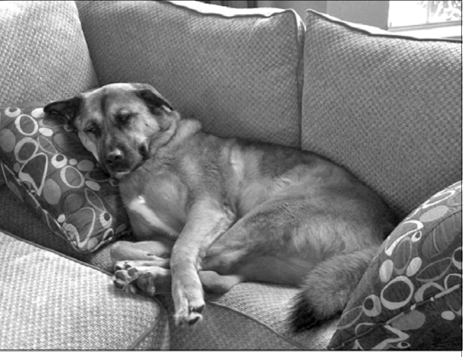
Grace (formerly Marigold) relaxes on her favorite couch.

We still walk at a park every morning, but now the park is filled with deer, rabbit, wild turkey and, her favorite, armadillos to chase (always on a leash of course, my shoulder aches to prove it). At home she has big bay windows to survey the neighborhood and a dog door to go outside. Between the exciting walks, freedom to