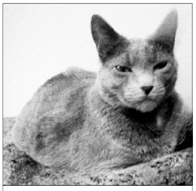
Cairo Heacock Adopted February 2013