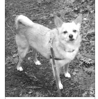
Ichiro Rice (formerly Safford) Adopted February 2013