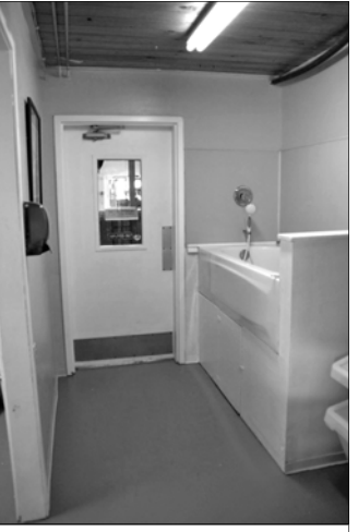
Tub room with door leading to laundry and isolation rooms.

These rooms have been painted, but now need updated furniture and storage cabinets. Please check the website and Amazon periodically to see how you can help.