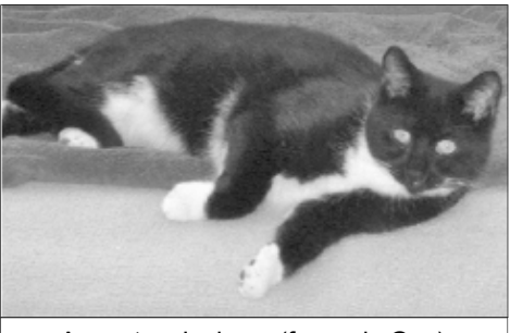
Augustus Jackson (formerly Gus) Adopted January 2013