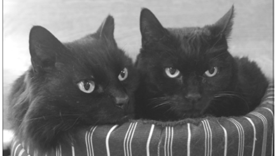
Hubby, age 10 and Wifey, age 11 came to CASA in February and are still waiting for you to adopt them.

But there is something about a senior cat that is compelling. Scared, bewildered and sometimes pathetic looking, these pets were once cherished members of someone's family. To be in a home environment one day and at a shelter with many other cats the next day is terrifying for older animals. We cannot explain to them that their person died or the baby is allergic or their family moved to no-pets housing. We do not always know their history if they