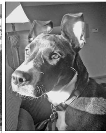
Bella Trowbridge Adopted Oct 2013

Visit camanoanimalshelter.org to view and read about all of our adoptable animals.