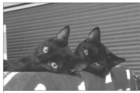
Tilford and Templeton Challenger Adopted Nov 2013