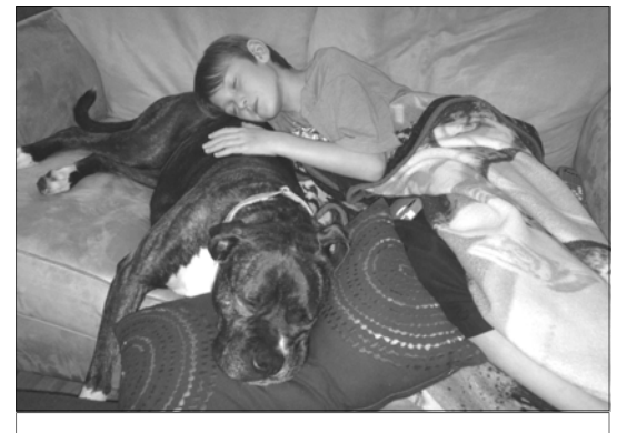
Missy and her best friend in the whole world.

Missy was rescued by the kind people at CASA from another shelter. We cannot express how grateful we are that CASA staff had the good sense to see past her supposed issues and to save her. It turns out that while easily spooked and very protective of her people, she is far from vicious. She is a silly, wiggle butt who sometimes doesn't know her own strength or energy and has been known to flail around in excitement causing injury to the unsuspecting bystander. It is clear that in her former home she was misunderstood and perhaps mistreated as a result, but with some gentle care