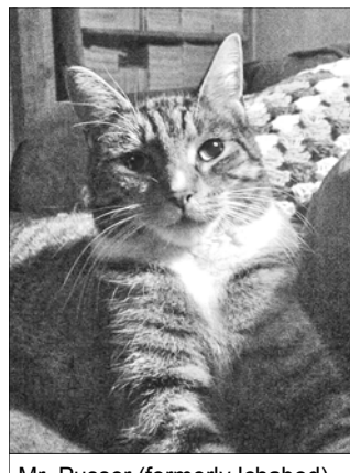
Mr. Pusser (formerly Ichabod) King Adopted Dec 2013