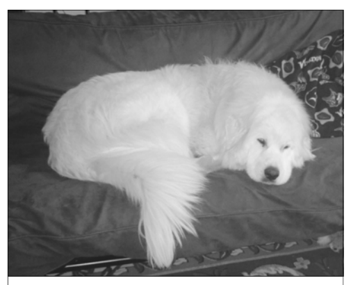
Nabi finally found her Forever Home.

When we went to CASA we had one dog in mind, but another family adopted him. We looked around saw this puppy, but after hearing how this little boy lost his dog, we decided he needed the puppy. The whole time this white polar bear looking dog, Nevasca, was eyeing us and we decided to see if she was a fit with our two dogs.