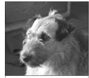
Mutzo Doolittle Adopted June 2014