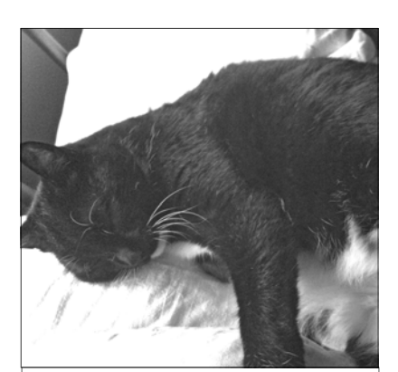
Oreo Swan (formerly Niko) Adopted May 2014