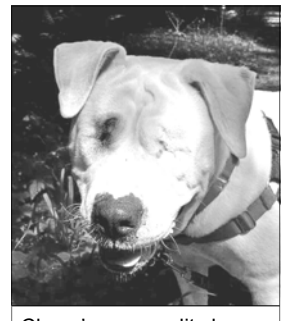
Chevy's personality began to shine.

Chevy came to CASA just hours before she was scheduled to be euthanized. For this family her care had become too expensive to continue. She had a raw and bleeding rash on her back end that was later attributed to poor diet. She was also afflicted with juvenile-onset glaucoma leading to total blindness at an early age. By the time she was 7 years old her eyes were bulging and painful, and were longoverdue to be removed. She was suffering, and it was the decision of the shelter manager to take Chevy under the loving care of CASA and get her the medical attention she needed.