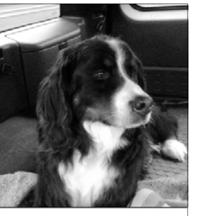
Zeus Sova Adopted Mar 2015