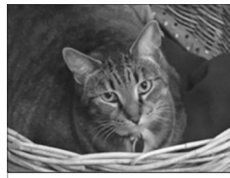
Tabitha Difloe Adopted Sept 2006