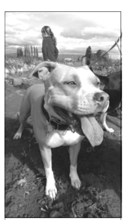
Buttercup Moore Adopted Nov 2013