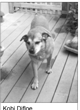
Kobi Difloe Adopted 2006