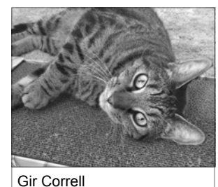
Adopted June 2015