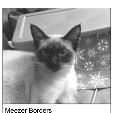
Adopted June 2014