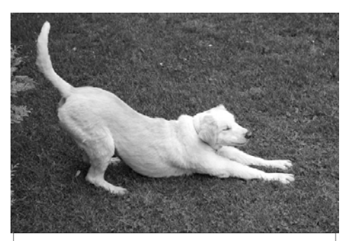
Doga - time with your dog

Are you interested in trying a new way to spend time with your dog, and getting some exercise at the same time? If so, you might be interested in Doga. What exactly is Doga? It is a type of yoga that combines massage and meditation with gentle stretching for dogs and their owners. While this may sound odd, the concept makes sense. The philosophy is that dogs are pack animals, so they are a good fit with yoga's emphasis on union and connection with other beings. In addition, they are considered natural healers, which is one of the principles of yoga. Doga uses poses and massage for dogs with the goal of improving digestion and heart function, and poses for people that emphasize stress reduction and feeling well.