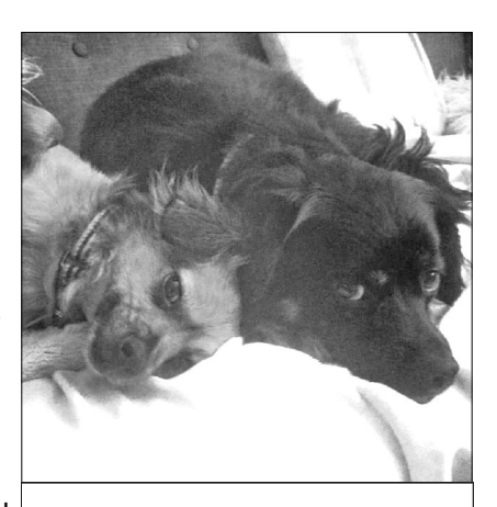
Moka and Momo together forever

We emailed CASA to tell them we wanted to reunite them, and they enthusiastically agreed. After the puppies were weaned we went to pick up Moka and found that Moka was half the size of Momo! The two were reunited in the CASA parking lot with wagging tails and big dog smiles. We learned that Moka has a super-star personality, is a great snuggler, and is the Houdini of hounds - she was an escape artist with the speed of a greyhound. She loves baiting Momo to play, and licks his ears and eyes every day like a good dog mama. Momo who previously would not play, started wrestling and chasing toys. It has been heartwarming to see them play together!