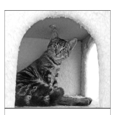
Where would you hide?

A cat will hide for all sorts of reasons, whether it's the sudden appearance of the cat carrier (indicating an upcoming car trip) or the frightening noise of the vacuum cleaner.