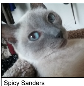
Adopted June 2016