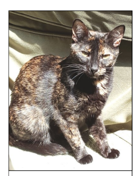
Gertie Eden Adopted Sept 2015