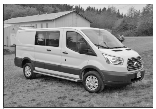
2015 Ford Transit Cargo Van will transport animals

CASA has been in need of a cargo van for a number of years. Currently animals are transported to spay/neuter appointments, checkups, emergency vet visits, adoption events, and transfers from other shelters in the personal cars of our staff and volunteers. Usually we cannot take all of the animals we would like to adoption events, because we can only transport what will fit into a sedan or SUV! As pet owners know, not all animals do well in cars and this leaves personal vehicles falling victim to the results. We need this van to save more lives and work more efficiently for the sake of our animals.