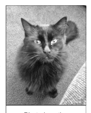
Pirate is active.