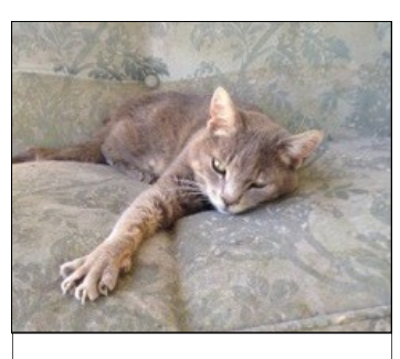
Callie relaxing at home