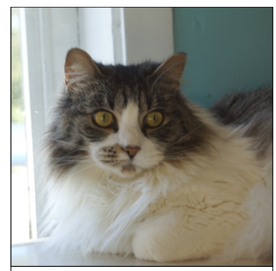
Delila requires a special diet.

Gathering detailed information helps the staff to know how to care for the animal while they are at the shelter and also helps in future placement. Environment plays a large part in the