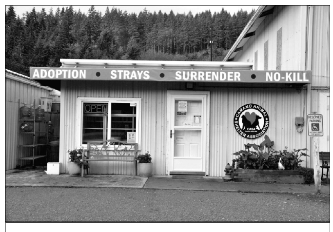
Banner shows what sets CASA apart.

The shelter entrance now dons a narrow red and white banner. The words on the banner: ADOPTION, STRAYS, SURRENDER, NO-KILL were chosen with care to describe what we do for the community and also sets CASA apart from other animal welfare organizations. We take animals from the public. Whether it is a STRAY from Camano Island or an owner-SURRENDER from Marysville we help our animals when they are in need.