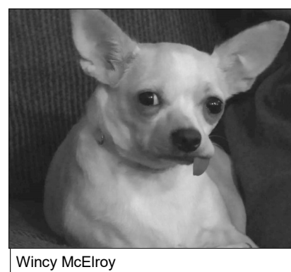
Adopted Jan 2016