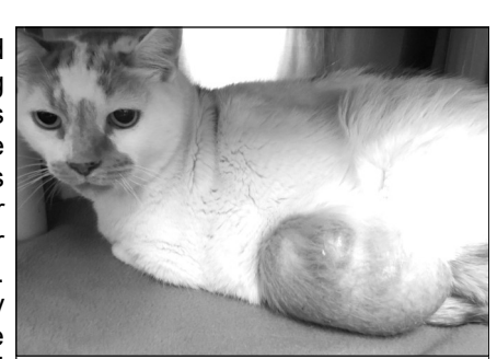
Harley, before surgery.

Harley, a white and orange shorthair cat, was surrendered to CASA in July, 2016. He had several tumors, including one weighing over one pound. It was clear he was uncomfortable and we did not know if the tumors might be malignant so the decision was made to have surgery as soon as possible Harley returned to the shelter after surgery a changed cat. His personality was no longer uncomfortable or grumpy as it had been when he arrived. He continued to recover at the shelter and results finally came back that the tumors were in fact benign. At the shelter he had physically recovered but as he really settled in he was not gaining weight back as the staff had anticipated and wasn't exactly thriving - as a senior cat in a shelter may not. The staff contacted a foster parent and Harley went to the foster home for