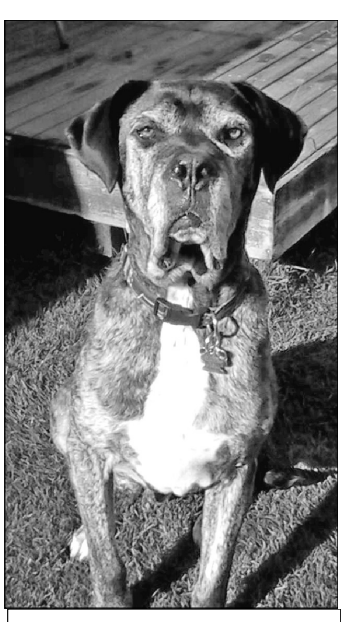
Tyson loves to "hang out"