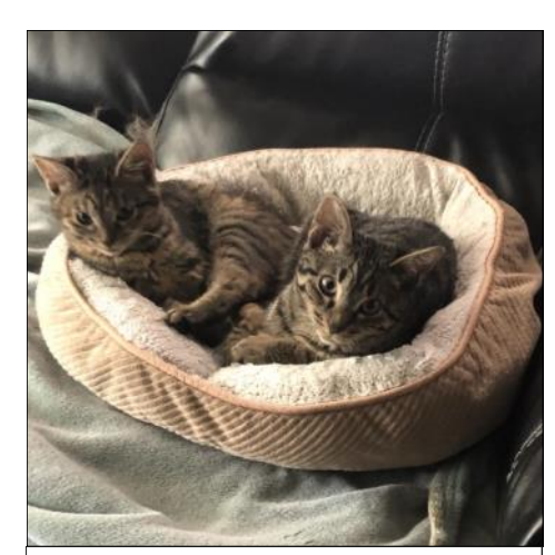
Tortellini and Bowtie are best buds and keep everyone entertained.

As time passed I read about single kitten syndrome and inquired about her siblings. Bowtie, her litter-mate, was also available for foster. Just recently I officially adopted them and they are the best of buds and keep each, other as well as the household, wildly-entertained. Thank you CASA!