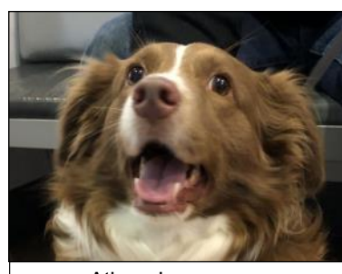
Athena's recovery is underway.

Thanks to generous donors and funds already at CASA, the surgery was scheduled. Surgery was performed at the Veterinary Specialty Center of Seattle in Lynnwood and Athena was taken to a foster home to recover. The surgery was successful and Athena improved steadily. In no time she had good range of motion and could put weight on the leg. She is now through the toughest part of her recovery and will continue to improve over time. She is a totally different dog than the one who walked into CASA originally. Athena had her big follow-up appointment where they x-rayed her one last time to make sure she was ready to move forward with her next phase