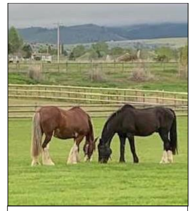
Rescue provides safe haven for draft horses.

"All Creatures Great and Small." We're all familiar with that phrase. When it comes to animal shelters, it's really true – there are safe havens for every size animal. Recently I was able to tour the "1 Horse At A Time Draft Horse Rescue" in Corvallis, Montana. The Draft Horse Rescue is driven by a single goal: to save unwanted, neglected and abused draft horses from going to slaughter! The rescue wants to do its part in making the world a better place for all, even if it can only be done "1 Horse At A Time." They seek out unwanted old, injured or sick draft horses being sold at auction that would otherwise be purchased and killed for meat.