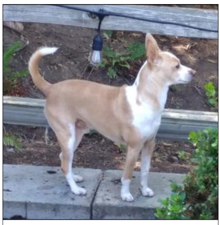
Nacho watching for wildlife