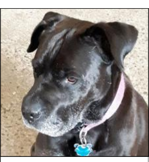
Maisie aka Mystic White Adopted 2008