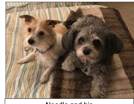
Noodle and his "brother", Smokey