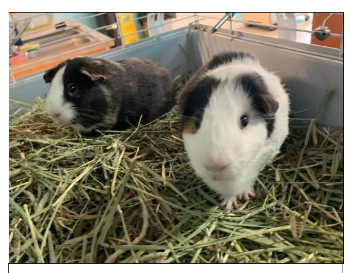
Huckleberry and Finn are waiting for just the right home.

Normally, Guinea Pigs are adopted quickly. In this case, however, potential adopters must have thorough knowledge of Guinea Pigs and access to an exotic animal veterinarian. As a bonded pair, Huckleberry and Finn must remain together because they rely on each other for companionship. Guinea Pigs with mites can develop seizures and this was the case with these boys. Unfortunately Huckleberry has residual seizure activity from his fight with mites. These seizures are very short. He is left unharmed, but this makes prior knowledge and experience essential.