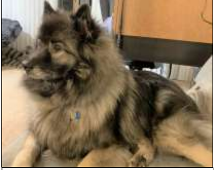
Max (Poof) Galper Adopted Oct 2020