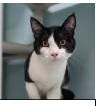
Bingo has a virus

Boulder is FIV+ and cannot be with other cats while at the shelter. He could live with other FIV+ cats, possibly with a non-confrontational FIV-cat, or as an only cat. FIV is spread through blood contact so with cats, fighting is the number one cause of transmission. With this in mind, Boulder is currently in the new critter room where he can see what is going on from his very own "apartment".